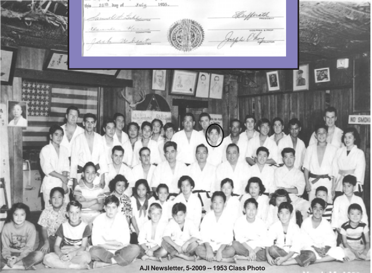
AJI Newsletter, 5-2009 -- 1953 Class Photo