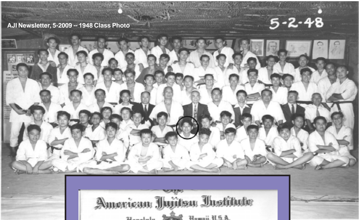
AJI Newsletter, 5-2009 -- 1948 Class Photo