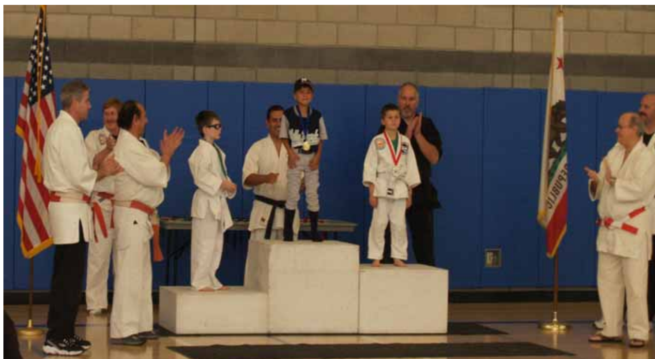
The Awards Ceremony for the event was special and will be memorable.