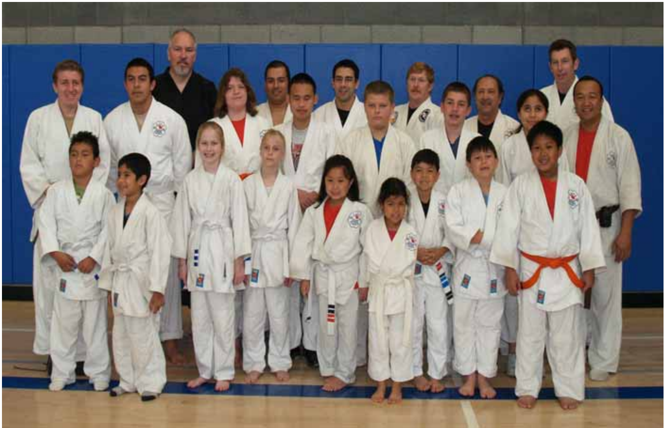
Participants are shown above for the ShoshinRyu Winter Classic Sumo Shiai held in Anaheim, California.