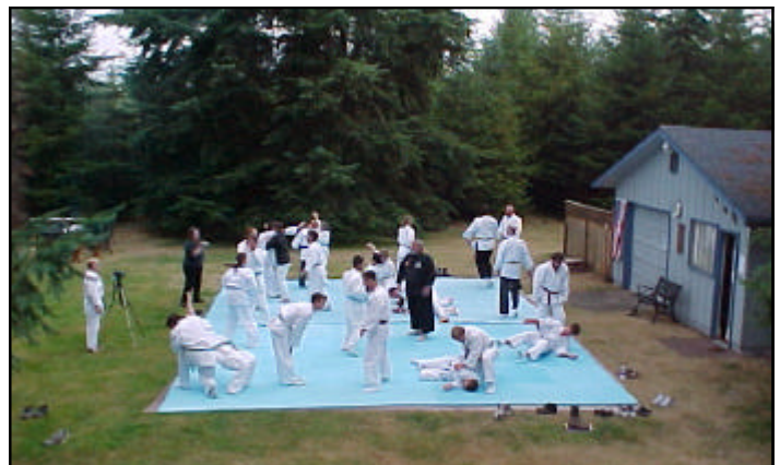
An overview of camp from the balcony.