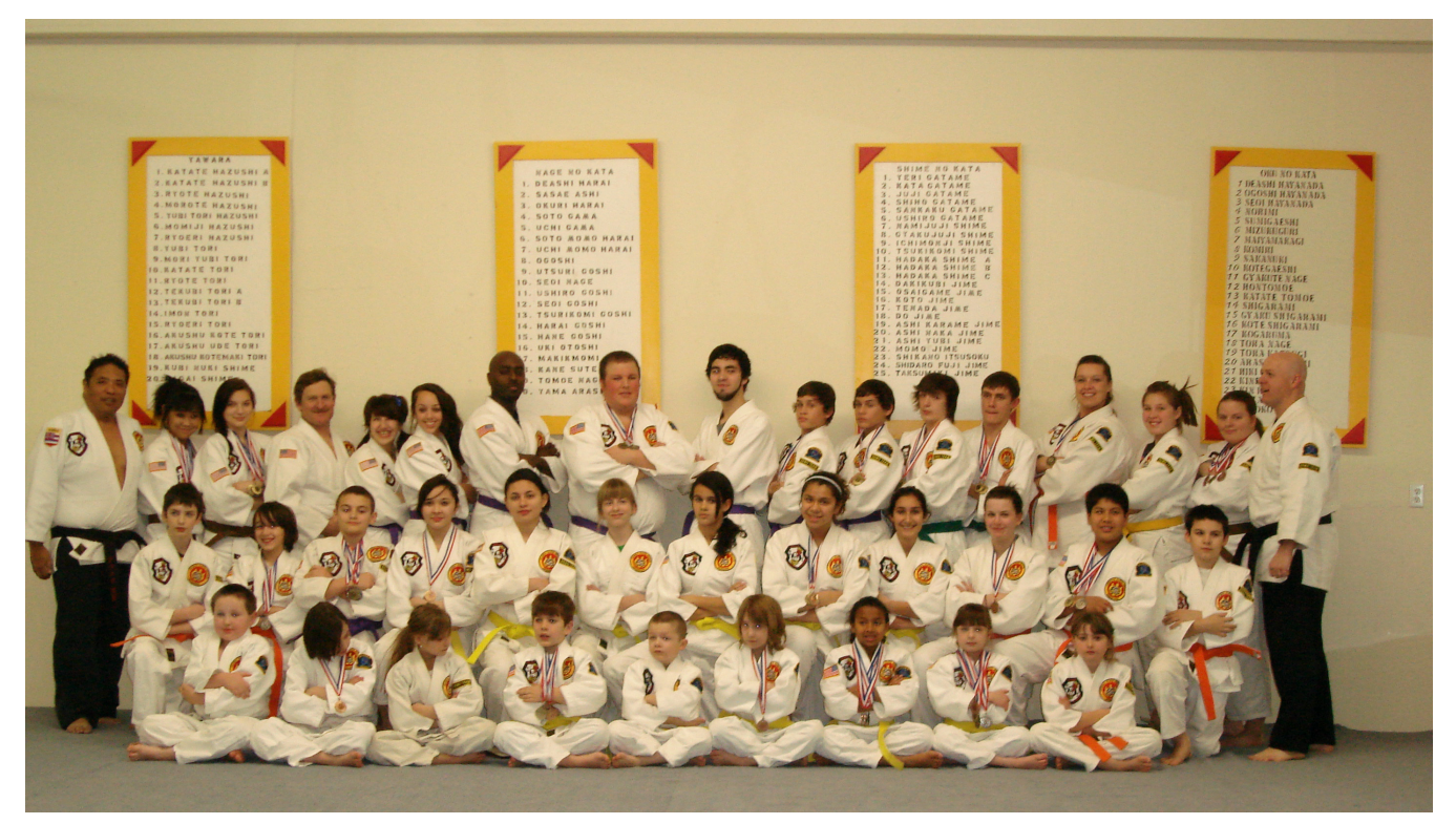
There was a good turnout for the Top of the World Invitational Tournament. The Alaska Jujitsu results are shown below.